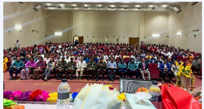
(Guests and attendees at the Peace Gold Award Ceremony)