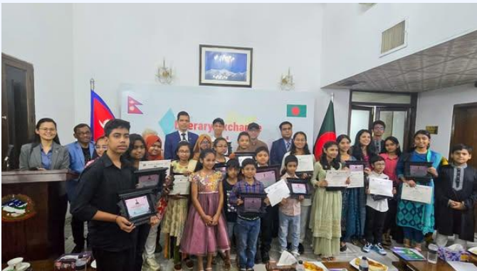
(Embassy team with winners of the Painting Competition-2025)

The Embassy organized a 'Literary Exchange and Prize Distribution Ceremony' in collaboration with the Bangladesh-Nepal Friendship Society (BNFS) on 25 February 2025.