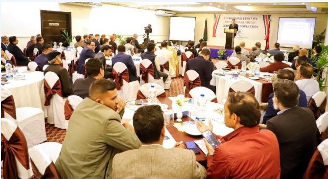
(Guests attending the event)