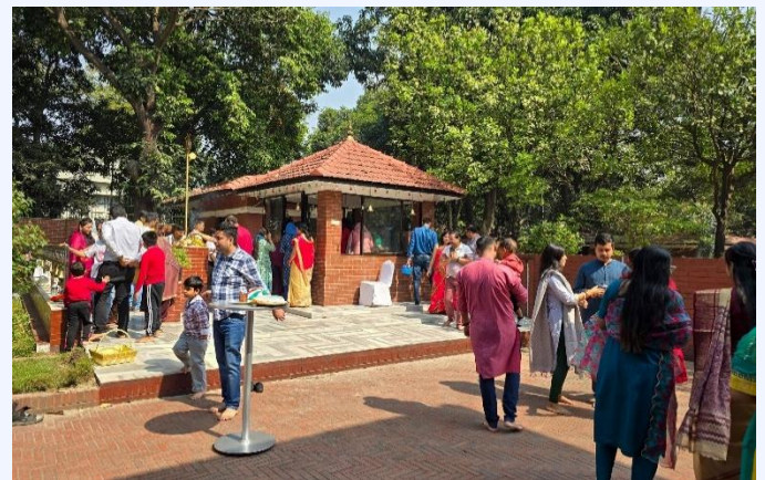
(Devotees visiting the temple at the Embassy premises)

On the auspicious occasion of Mahashivaratri, the Embassy extended greetings and best wishes to the people celebrating the festival on 26 March. The Shiva temple inside the Embassy premises was open to the public and over 400 people from Nepali, Indian and Bangladeshi Hindu communities residing in Dhaka visited the Shiva temple.