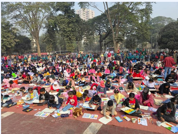
(Young students participating in the Painting Competition)

The Competition was held under the theme "Nepal Through My Eyes", with an objective of providing a platform for participating students to creatively express their unique perspectives on Nepal through their artworks while celebrating the bonds of friendship between Nepal and Bangladesh.