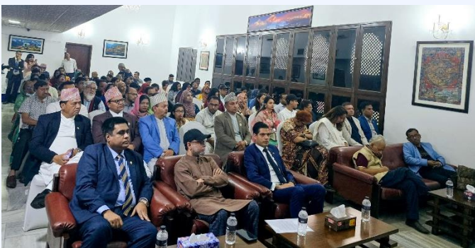
(Guests and dignitaries attending the event)

The event featured the presentation of literary papers, recitation of poems, and critiques on the cultural and linguistic similarities between Nepal and Bangladesh. The winners of the 'Painting Competition- 2025' held on 24 January 2025 under the theme 'Nepal Through My Eyes' were also felicitated.