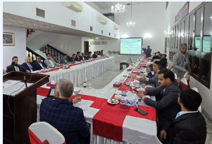
(Participants at the Roundtable event)