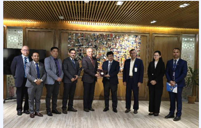
(IBN delegation with BIDA team)