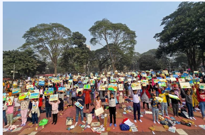
(Participants showcasing their artworks at the Painting Competition)