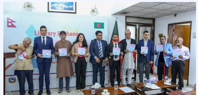
(Dignitaries unveiling the Painting Catalogue)