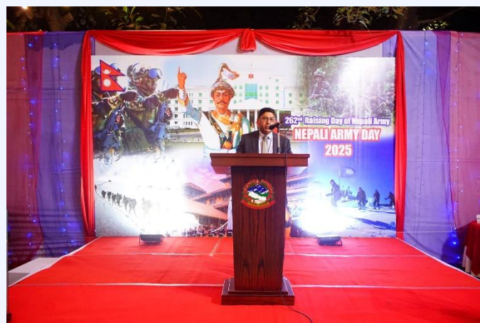
(Chief of the Army Staff of Bangladesh Army General Waker-Uz-Zaman delivering his remarks)

Chief Guest of the event, Chief of the Army Staff of Bangladesh Army General Waker-Uz-Zaman commended the wide-ranging efforts of the Nepali Army both at home and abroad. He emphasized the longstanding and friendly relations between the armed forces of Nepal and Bangladesh and stressed the importance of military cooperation as a key component of bilateral relationship.