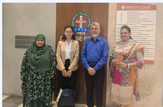
(The Embassy team with the college authorities of Enam Medical College)

During the interaction, various matters concerning Nepali students were addressed by the Embassy team.