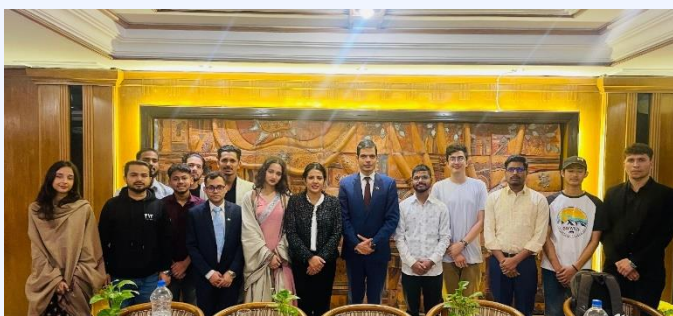
(Embassy officials with Nepali students from various colleges in Chattogram)

The medical students primarily raised concerns about the issue of stipend for intern doctors and the need for regular visits from the Embassy, among others.