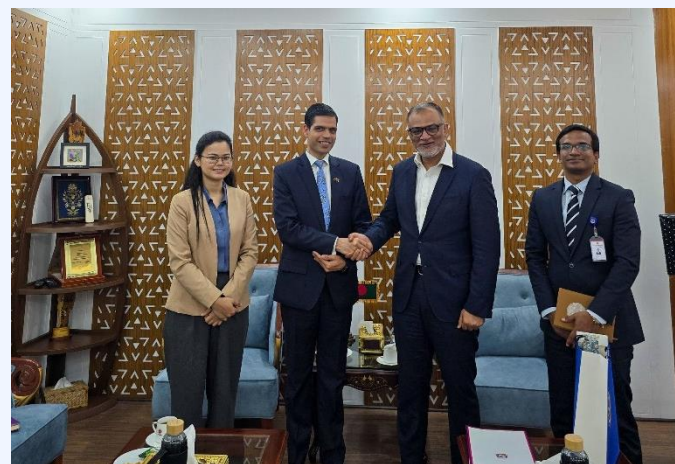
(Embassy officials during the courtesy call on the Adviser for Commerce)

They exchanged views on the trade linkages between Nepal and Bangladesh, noting their gradual but steady growth. The Ambassador shed light on the promises and potential existing in the areas of trade and investment and underscored ways to tap on them.