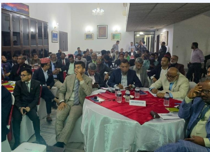
(Guests attending the tourism promotion and networking event)