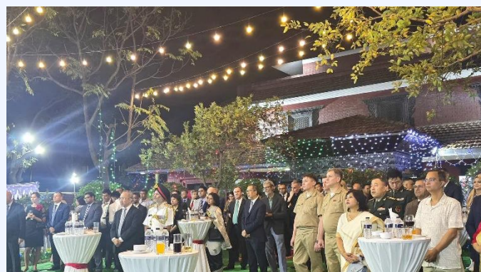
(Guests attending Nepali Army Day Celebration)