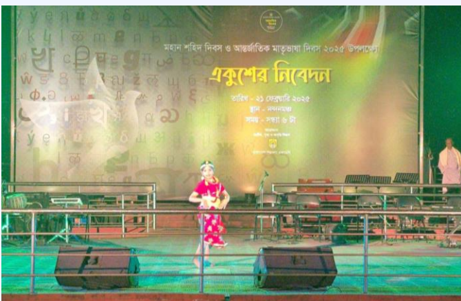
(Performance at the Bangladesh Shilpakala Academy)

Advisers of the Government, senior leaders of political parties, freedom fighters, Ambassadors and Heads of Mission, and high-ranking civil and military officials were present on the occasion.