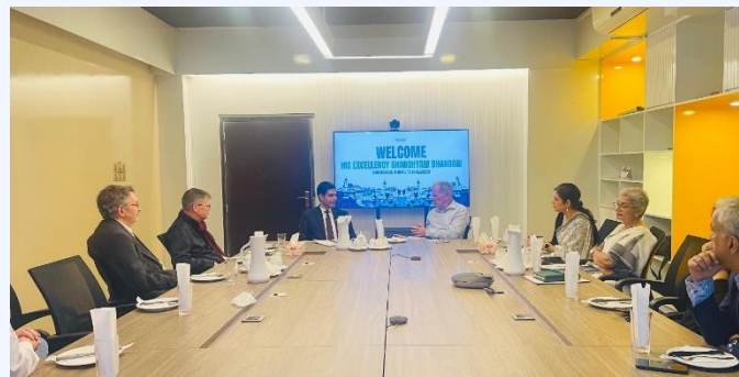
(Ambassador with the management team of AUW)