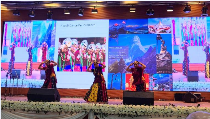
(Embassy family performing at the Foreign Service Academy)