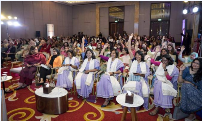
(Guests and women mountaineers attending the event)

feminist literature written in 1905, which underpinned the expedition motive.