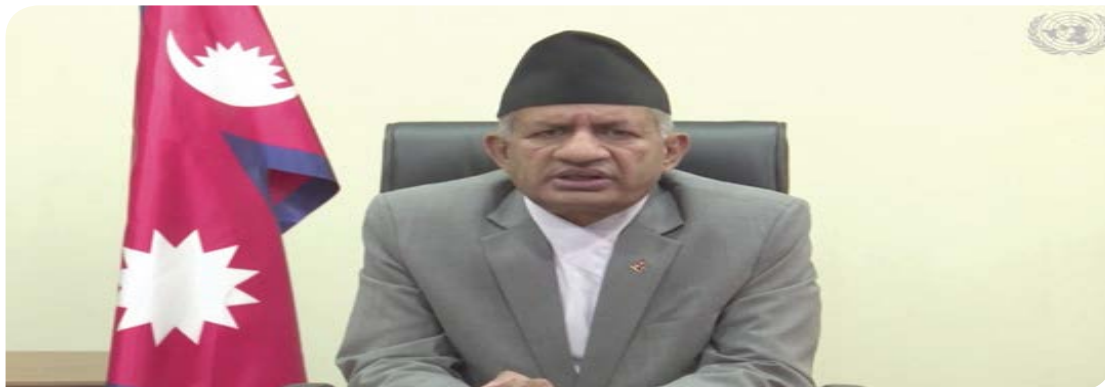
The Foreign Minister Addressing the High-level Segment of the 46 th Session of the Human Rights Council.

Rights Council on 23 rd February 2021. While addressing the session, Foreign Minister reiterated Nepal's commitment to ensuring full enjoyment of all human rights for women, girls, children, and persons with disabilities. He also urged for international cooperation for ensuring the rights of the migrant workers as well as for delivering global commitment on climate change.