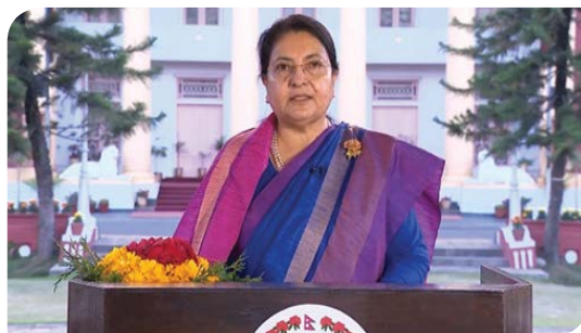
The President Speaking at the P4G Seoul Summit

President Mrs. Bidya Devi Bhandari addressed 'the Leaders Session of the 2021 P4G (Partnering for Green Growth and the Global Goals 2030) Seoul Summit' through a video message on 30 May 2021. Focusing her intervention on "Inclusive Green Recovery from COVID-19", the President emphasized the importance of investing in climate adaptation in LDCs by increasing their access to climate finance and technology.