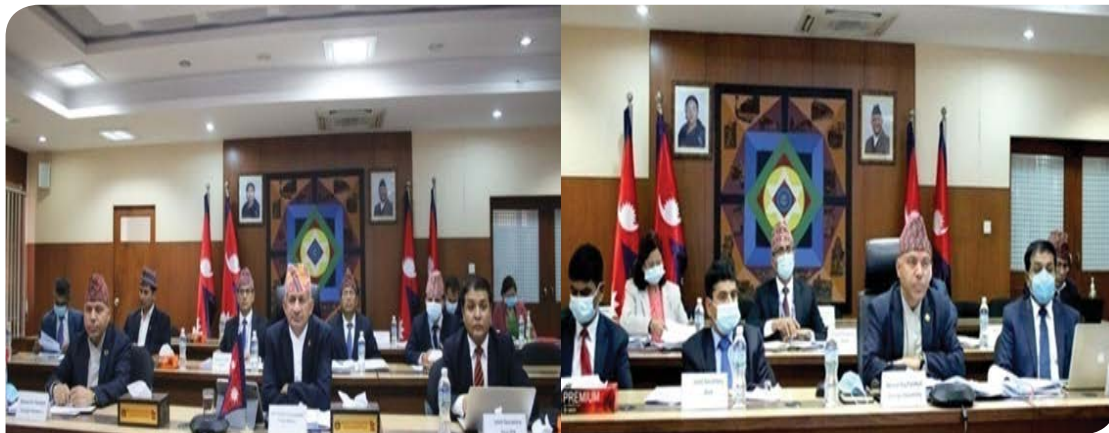
The Foreign Minister (left) and the Foreign Secretary (right) Leading the Respective Nepali Delegations during the 17 th BIMSTEC Ministerial Meeting and BIMSTEC SOM

Nepal participated in the 17 th BIMSTEC Ministerial Meeting convened virtually on 1 April 2021 by Sri Lanka, the current Chair of the Organization.