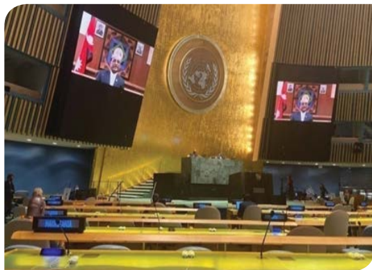
The Deputy Prime Minister and Minister for Foreign Affairs Addressing the Joint Thematic Event on LDCs

Deputy Prime Minister and Minister for Foreign Affairs Mr. Raghbir Mahaseth addressed, through a pre-recorded video statement, the Joint Thematic Event on the Least Developed Countries convened by the Presidents of the General Assembly and the Economic and Social Council (ECOSOC) under the theme of 'Diversifying the Financing Toolbox to Enhance Investment in the Least Developed Countries' on 18 June. In his statement, DPM Mr. Raghbir Mahaseth expressed Nepal's commitment to making the graduation process smooth and sustainable by mobilizing finances from the public as well as private sectors, and internal as well as external sources.