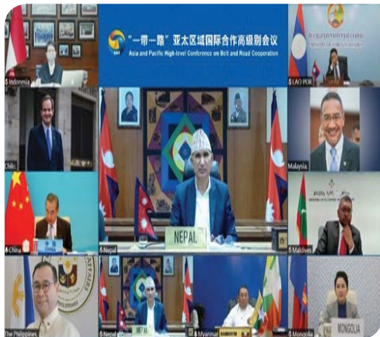
The Deputy Prime Minister and Minister for Finance Attending Asia and Pacific High-level Conference on Belt and Road Cooperation

Addressing the Conference, DPM Paudel laid emphasis on strengthened global partnership in defeating COVID-19 and the need to prioritize LDCs and poorer countries for COVID-19 vaccine cooperation. The Conference launched two initiatives under the Belt and Road Partnership on COVID-19 Vaccines Cooperation, and on Green Development.