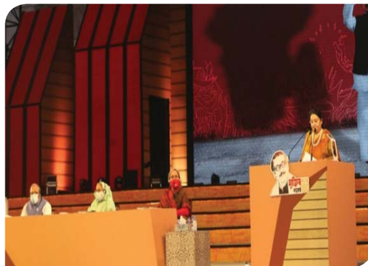
The President Addressing Bangabandhu's Birth Centenary Celebration Programme

Bangladesh Mr. Mohammad Abdul Hamid to attend the birth centenary celebration of the Father of the Nation of Bangladesh, Bangabandhu Sheikh Mujibur Rahman.