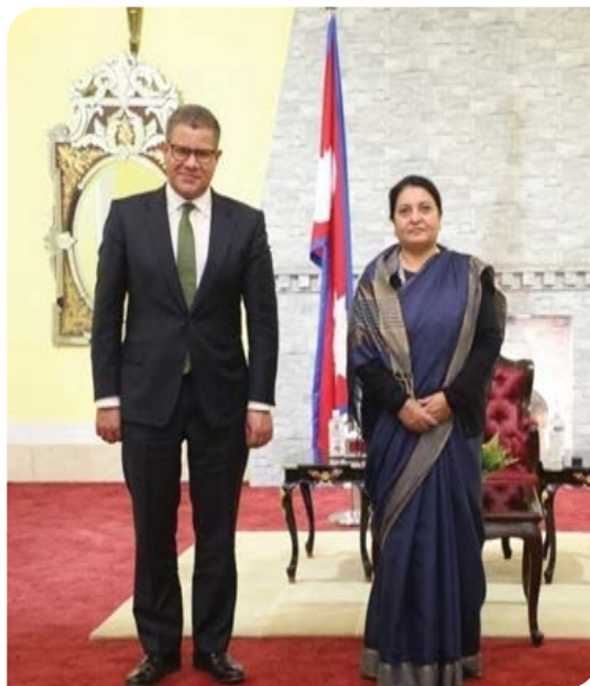
Mr. Alok Sharma, President of CoP26 during Courtesy Meeting with the President of Nepal

British support in Nepal's fight against COVID-19 was significant. It provided 45.8 million GBP of direct COVID-19 support in addition to reallocating the 30.2 million GBP of its existing budget to focus on COVID-19 recovery. The UK government also provided important support of medical items including ventilators during the crisis.