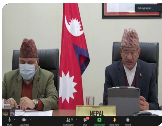
The Foreign Minister and the Foreign Secretary Attending the 17 th Ministerial Meeting of ACD

Nepal participated in the 17 th Ministerial Meeting of Asia Cooperation Dialogue (ACD) hosted virtually on 21 January 2021 by Turkey as the current Chair. The meeting deliberated on the theme “The New Normal and Safe and Healthy Tourism.”