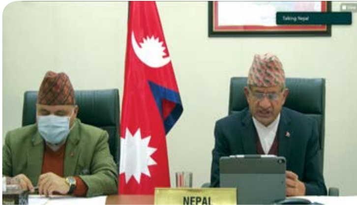
Meeting of Asia Cooperation Dialogue