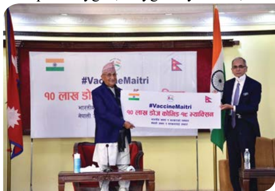
India Providing One Million Doses of Covishield Vaccines to Nepal

The two countries continued their cooperation in fighting the COVID-19 pandemic together. India supplied 1 million doses of Covishield vaccines to Nepal on grant basis in January 2021. India also supplied 3,48,000 doses of vaccines through COVAX facility and additional 1,00,000 doses to the Nepali Army. India eased the restrictions on medical supplies, including the supply of liquid oxygen, oxygen cylinders, and