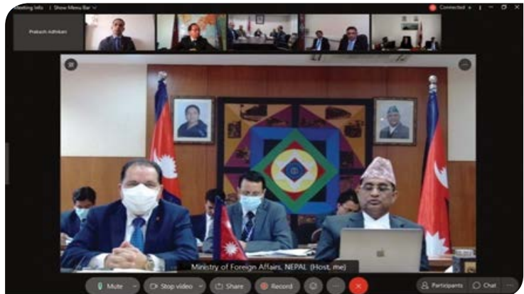
The Deputy Prime Minister and Minister for Foreign Affairs of Nepal Interacting with the Ambassadors and Heads of Nepali Missions