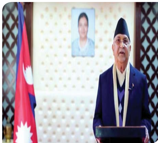
The Prime Minister Addressing the 31 st Special Session of the UNGA in Response to the COVID-19 Pandemic

Prime Minister Mr. K P Sharma Oli led a high-level Nepali delegation to "The 31 st Special Session of the United Nations General Assembly in Response to the COVID-19 Pandemic", held virtually on 03-04 December 2020. Addressing the special session, Prime Minister Oli called for the genuine collective commitment to fend off the crisis, save lives, and protect societies. He underlined the necessity of universal access to COVID-19 vaccines.