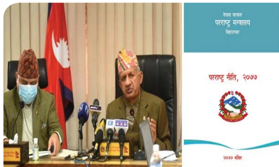
Minister for Foreign Affairs Mr. Pradeep Kumar Gyawali Speaking on Foreign Policy, 2020

On 20 February 2021, the Ministry organized an interactive programme for the Ministry's officials to orient them on various aspects of newly enacted foreign policy and also to discuss on improvement in the operation of the Brain Gain Center (BGC).