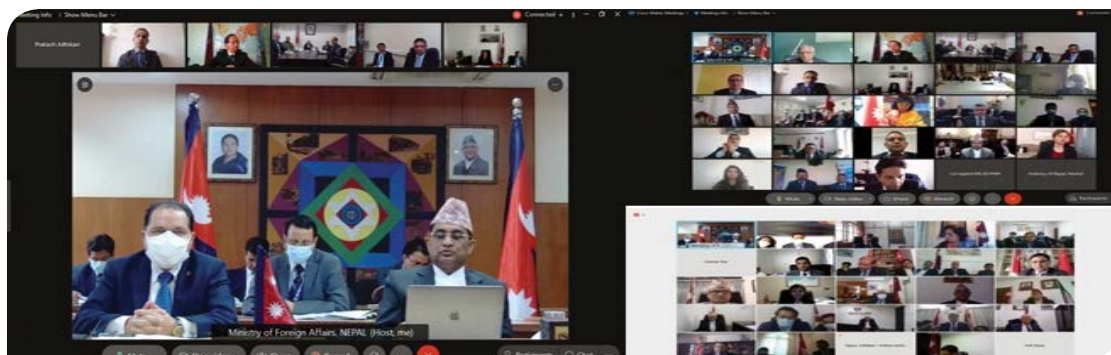
Deputy Prime Minister and Minister for Foreign Affairs Mr. Raghuraj Mahaseth Interacting with Ambassadors and Heads of Nepali Missions

As a unified policy document with clear guidelines on diverse spheres of foreign policy dimensions, the Ministry unveiled Foreign Policy, 2020 in December 2020. The policy addresses the aspiration of the country with clear focus on economic diplomacy and issues of international and regional concerns.