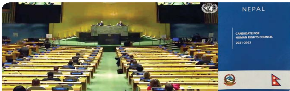
During Elections for New UNHRC Members for the Term 2021-23

in a hybrid modality in Bangkok on 23-26 March 2021.