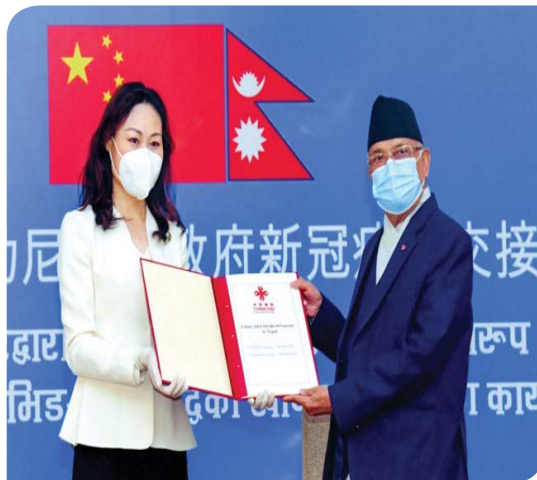
China Providing Additional Doses of COVID-19 Vaccines

China has extended valuable support to Nepal in fighting the COVID-19 pandemic since the early phase of its outbreak. The medical assistance from China and its provincial governments of Tibet, Sichuan and Yunnan was helpful in stepping up the public health system and protecting people's lives and livelihoods. China-aided first batch of 8,00,000 COVID-19 vaccines was airlifted to Kathmandu on 29 March 2021. Three months later, Nepal received an additional grant assistance of 1 million doses of Sinopharm vaccines.