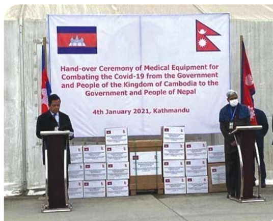
Handover Ceremony of Medical Equipment from Cambodia

The Embassy of Nepal in Bangkok coordinated the operation of two repatriation flights for Nepali nationals stranded in Cambodia due to the COVID-19 pandemic.