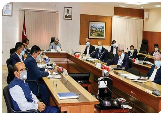
The Foreign Secretary Co-chairing the Eighth Meeting of Nepal-India Oversight Mechanism