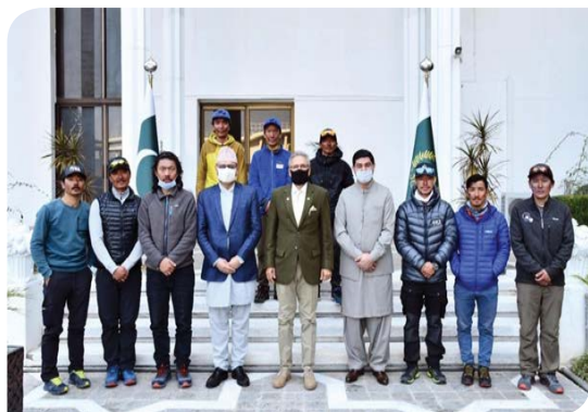
Nepali Mountaineers with the President of Pakistan

16 January 2021 would be remembered forever in Mt. K2 history.