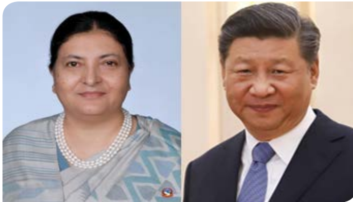
Telephone Conversation between the Presidents of Nepal and China