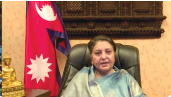
The President Addressing the Twenty-fifth Anniversary of the Fourth World Conference on Women