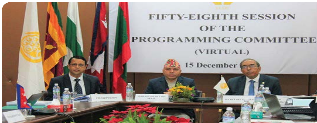
Foreign Secretary of Nepal and SAARC Secretary General during the Fifty-eighth Session of the Programming Committee

November 2020. The Ministers and Heads of Delegation shared their experiences pertaining to the effects of the COVID-19 pandemic in the implementation of SDGs in their respective countries and emphasized the need of collective cooperation and collaboration to lessen the effects of the pandemic. The Meeting adopted a report on contextualization of the SDGs at the regional level, accelerated implementation of 2030 Development Agenda and development financing.