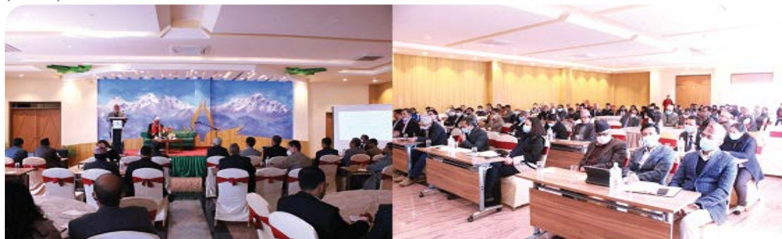
Interaction Programme on Nepal's Foreign Policy and BGC

The Ministry continued its internal preparation for organizing the first episode of Sagarmatha Sambaad on the theme of "Climate Change, Mountains, and the Future of the Humanity." The dialogue, postponed due to outbreak of the COVID-19 pandemic, was originally scheduled to be held in Kathmandu on 2-4 April 2020 in partnership with IFA and Policy Research Institute (PRI).