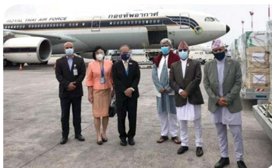
Handover Ceremony of Medical Supplies from Thailand

Nepal and Thailand continued to maintain steady relations of friendship and cooperation, which was exemplified by mutual solidarity and support for the control and prevention of the COVID-19 pandemic. The Royal Family of Thailand provided Nepal with anti-epidemic materials and emergency medical supplies including surgical masks, PPE sets, face