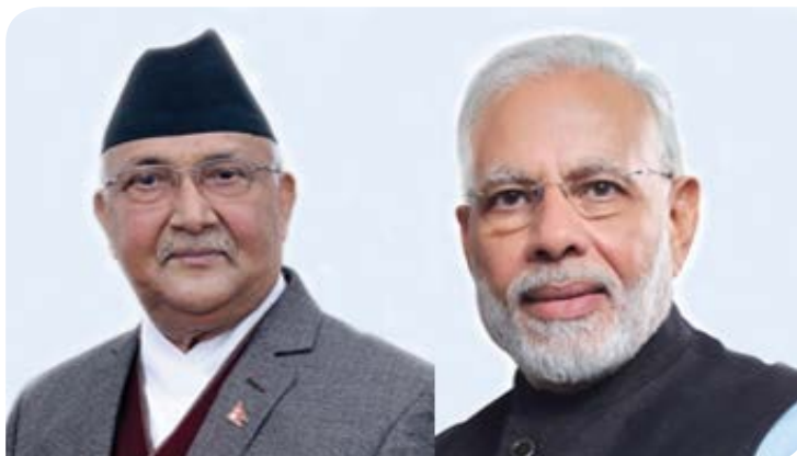
Telephone Talk between the Prime Ministers of Nepal and India