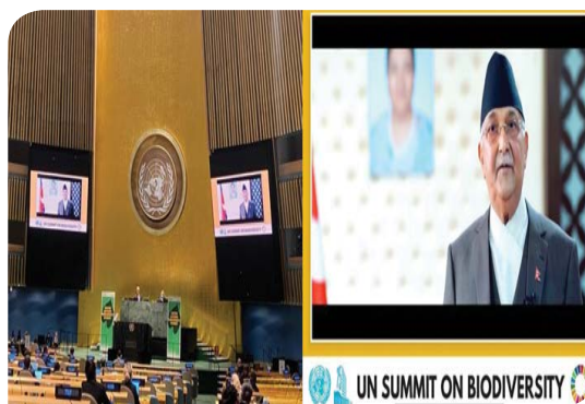
The Prime Minister Addressing the UN Summit on Biodiversity

Prime Minister Mr. K P Sharma Oli addressed the "Leaders' Pledge for Nature: United to Reverse Biodiversity Loss by 2030 for Sustainable Development" held on 28 September 2020. In his pre-recorded message, the Prime Minister called for containing the human-induced depletion of biodiversity.