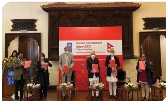
The Foreign Minister Launching the Human Development Report 2020

Foreign Minister Mr. Pradeep Kumar Gyawali delivered a statement at an event 'Nepal's Contribution to UN peacekeeping' organized by ISAS, COSATT, and KAS on 19 April 2021, focusing on three key aspects: Nepal's contribution to UN peacekeeping, Nepal's perspectives on peacekeeping, and the challenges to further enhance this flagship contribution of Nepal to the noble cause of international peace and security. On the occasion, he expressed satisfaction