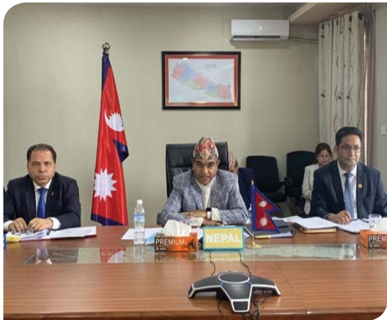
The Foreign Secretary Addressing the 21 st Session of the BIMSTEC Senior Officials' Meeting (SOM)

BIMSTEC Secretary General, finalized the draft of the BIMSTEC Charter, and finalized the draft of the Memorandum of Association on the Establishment of the BIMSTEC Centres/Entities, among others.