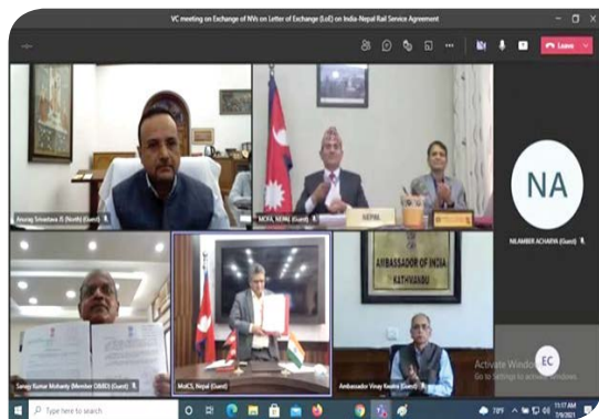
Delegation Members from Nepal and India in the Virtual Meeting

LoE updates various provisions of the RSA and brings them in line with the latest operational and infrastructure status of Nepali and Indian Railways.