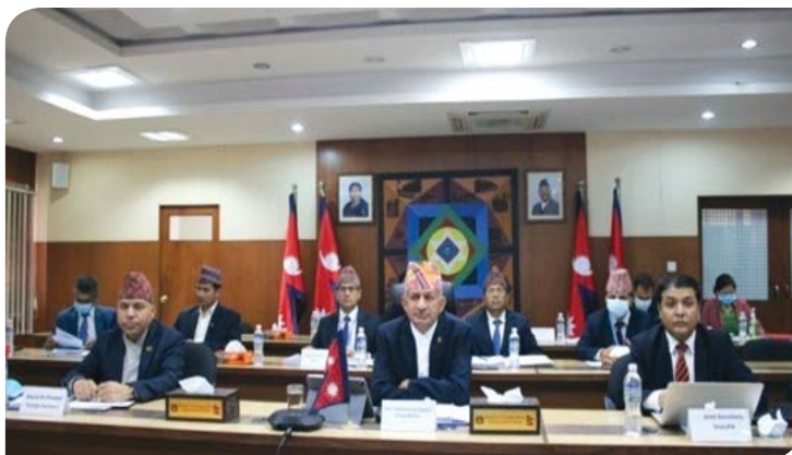
The Foreign Minister of Nepal Attending the 17 th BIMSTEC Ministerial Meeting