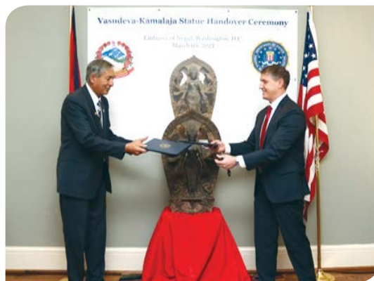
Statue Handover Ceremony at EoN, Washington DC

Nepal received valuable support from the US in repatriating the lost Nepali cultural artefacts. Our Embassy in Washington D.C. received two such artefacts namely Vasudeva Kamalaja statue from the Dallas Museum of Arts on 5 March 2021 and Chaturmukhi Shivlinga statue from Art Institute of Chicago on 16 April 2021. The Consulate General in New York coordinated the repatriation of three Nepali antiquities, namely seated Ganesh, seated Buddha in Bhumisparsha Mudra, and Wooden Beam depicting a coloured Apsara, recovered in New York this year. Efforts are being made to repatriate other cultural artefacts lost from Nepal.