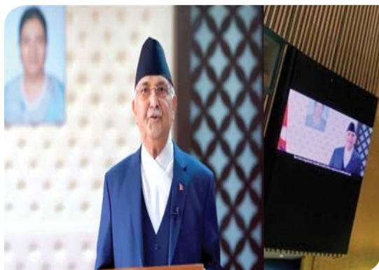
The Prime Minister Addressing the 75 th Session of the UNGA through a Pre-recorded Video

Prime Minister Mr. K P Sharma Oli addressed the 75 th session of the United Nations General Assembly (UNGA) through a pre-recorded video message on 25 September 2020. In his address, the Prime Minister highlighted Nepal's views on several issues of global importance including peaceful resolution of conflicts, climate crisis, WTO reforms, and the Agenda 2030 for SDGs.