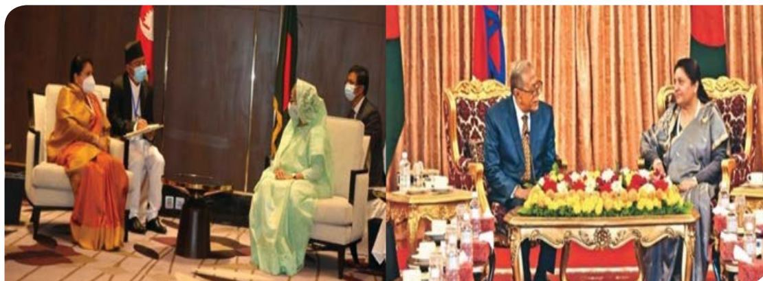
The President during Meeting with the President (right) and the Prime Minister of Bangladesh (left)

thanked Nepal for its prompt recognition of the independent Bangladesh. Similarly, the Chairperson of Bangabandhu Birth Centenary Celebration Committee Prime Minister Sheikh Hasina also commended Nepal's immediate recognition of Bangladesh. They stressed on the need to further strengthening the cordial relations between Bangladesh and Nepal. During the birth centenary celebration programme, a Nepali cultural troupe presented Nepali cultural performance.