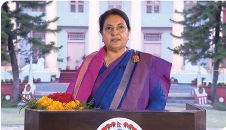
The President of Nepal Speaking at the P4G Seoul Summit