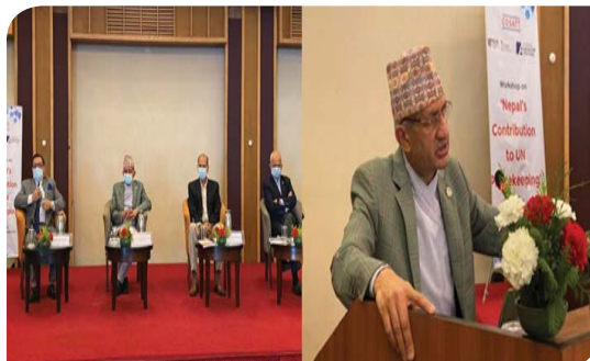
The Foreign Minister Addressing the Event on "Nepal's Contribution to the UN Peacekeeping"