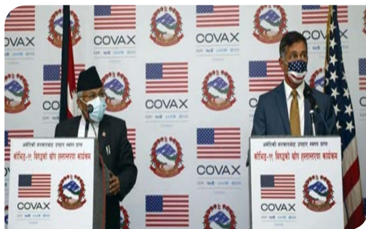
Handover Programme of COVID-19 Vaccines from the United States of America

The United States provided Nepal with 1.53 million doses of J&J vaccines on 12 July 2021 as a major humanitarian support. In addition, efforts to acquire vaccines from the US pharmaceutical companies continued.