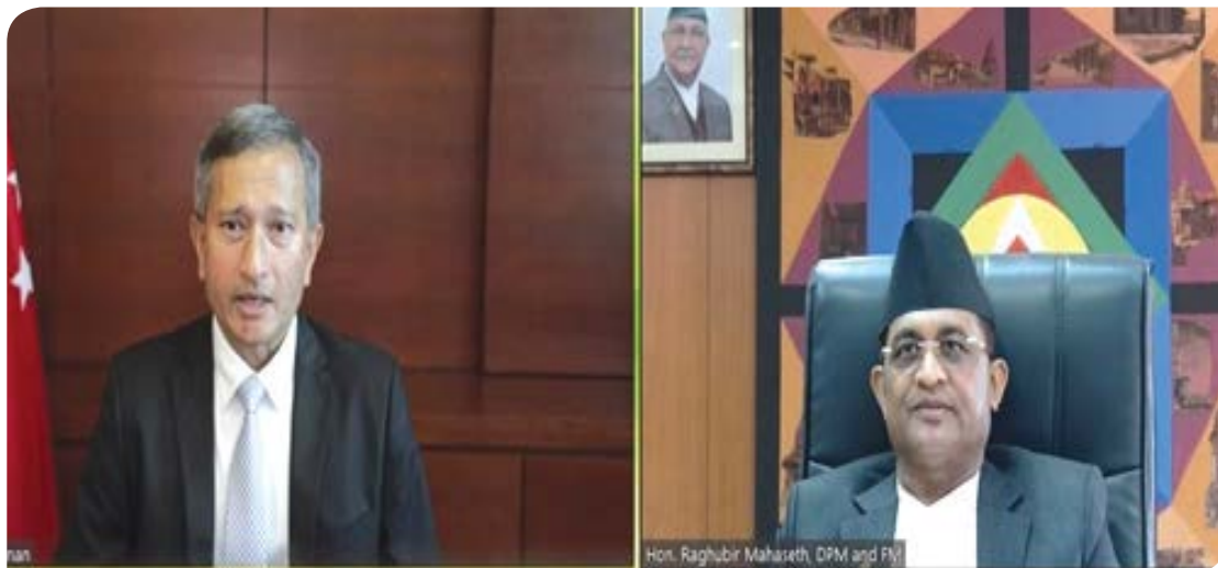
The Deputy Prime Minister and Foreign Minister of Nepal and the Foreign Minister of Singapore during the Virtual Meeting

The bilateral relations between Nepal and Viet Nam remained steady, marked by friendship, cordiality, and cooperation. The Government of Viet Nam expressed its solidarity in fighting against the COVID-19 pandemic and sent a shipment of medical supplies including PCR test kits in June 2021.