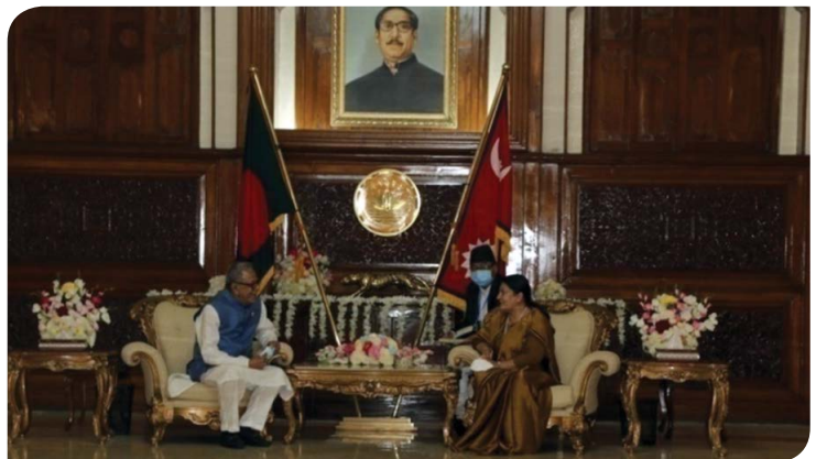
The President of Nepal in Meeting with the President of Bangladesh