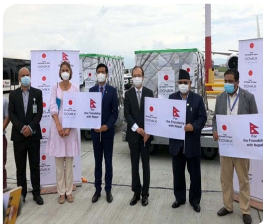
Handover Ceremony of COVID-19 Vaccines Supported by Japan

Japan provided 16,14,740 doses of AstraZeneca vaccines to Nepal at a time when priority age-groups including senior citizens were in urgent need for inoculation of second doses. Besides, Japan also expressed solidarity with Nepal in combating COVID-19 by providing various medical equipment.