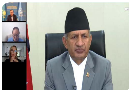
The Foreign Minister Addressing the 19 th Annual Ministerial Meeting of LLDCs

Minister for Foreign Affairs Mr. Pradeep Kumar Gyawali addressed the 19 th Annual Ministerial Meeting of Landlocked Developing Countries (LLDCs) held on the margins of the 75 th session of the UNGA on 21 September 2020. The Foreign Minister welcomed Secretary General's roadmap for accelerating the implementation of the Vienna Programme of Action (VPoA) and called for effective partnerships among LLDCs, their transit neighbours, development partners, the UN, and other stakeholders.