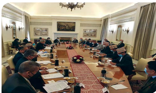
The Sixth Meeting of the Nepal-India Joint Commission

The Commission reviewed the entire spectrum of bilateral relations that included the important areas such as cooperation in the supply of COVID-19 vaccines, boundary and border management, connectivity and economic cooperation, trade and transit, power and water resources, and culture and education.