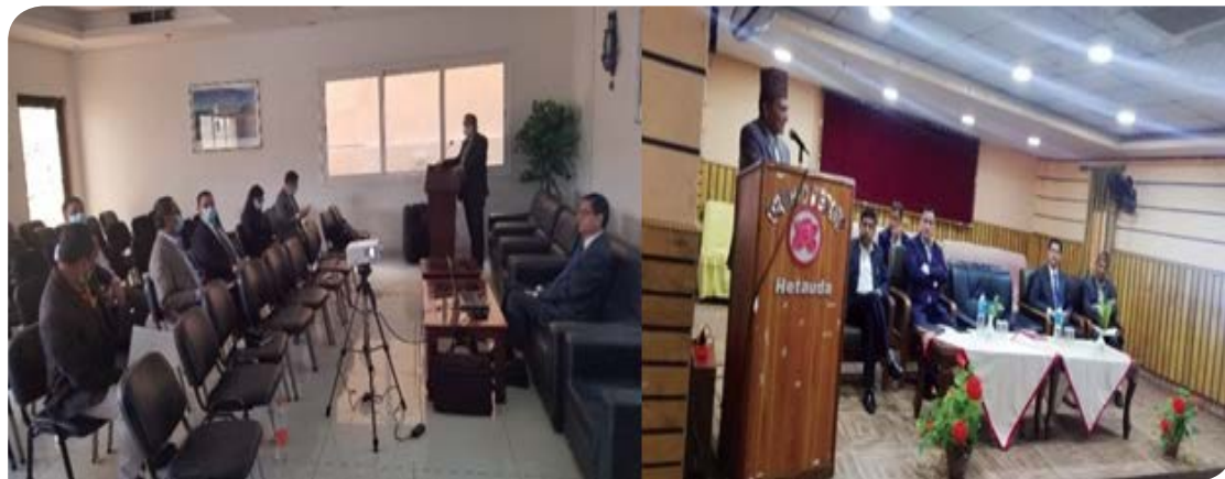
Orientation Programme in Hetauda, Feb 2021 Orientation Programme in Kuwait, July 2021

pandemic, the Department conducted orientation & training programs on MRP and e-passports at Hetauda, Surkhet and Dhangadhi. Such training programmes were also provided to Nepali missions abroad in Jeddha, Oman and Kuwait.