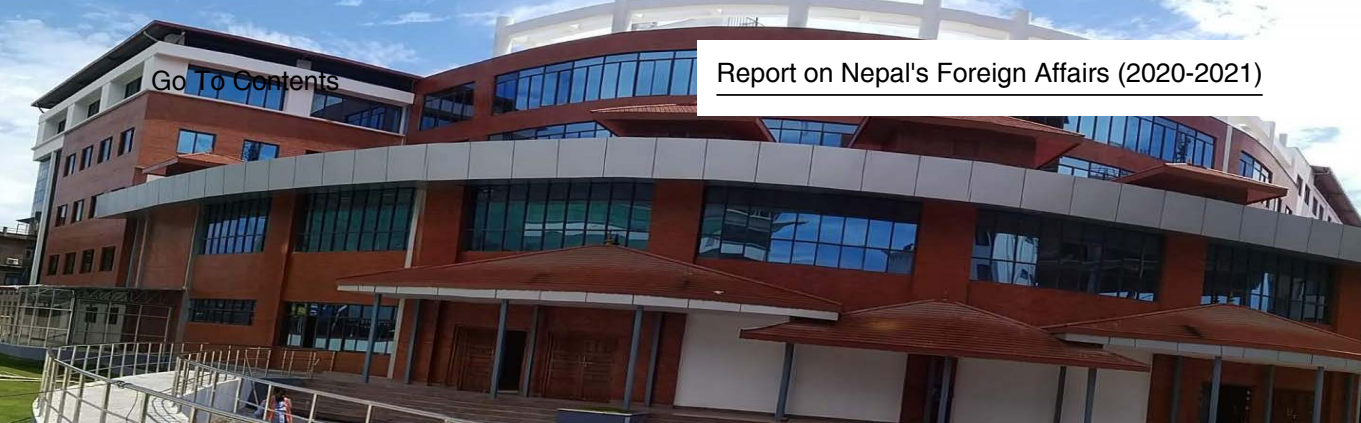
Newly Constructed Multi-purpose MoFA Building at Tripureshwor, Kathmandu

policy. Recruitment, placement and transfer of the staff within the Ministry, the departments and the missions abroad were carried out as necessary.