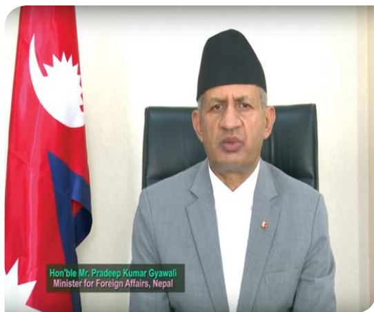
The Foreign Minister Delivering Statement at the Annual Ministerial Meeting of NAM

margins of the 75 th session of the UNGA on 9 October 2020. This year's theme was “Bandung+65: More Relevant, United and Effective NAM against Emerging Global Challenges, including COVID-19”. In his address, the Foreign Minister underlined the relevance of the Bandung Principles as time-tested and sacrosanct ideals for the peaceful global order. He also stressed on the need for numerical and moral strength of NAM in amplifying the voice of the weak and vulnerable countries.