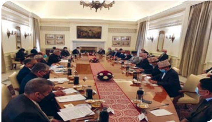
The Foreign Minister of Nepal and the External Affairs Minister of India at the Meeting of the Nepal-India Joint Commission