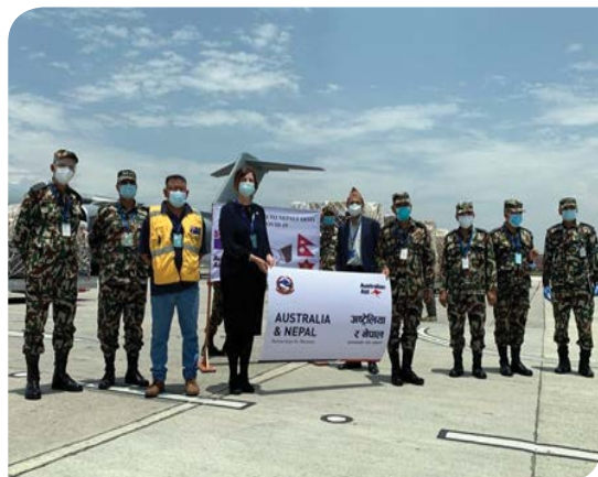
Ambassador of Australia to Nepal Handing Over the Medical Supplies to Nepal Army

Nepal and Australia continued to enjoy friendly and cooperative relations over the reporting period. Nepali diaspora has become an important part of the bilateral relations. More than 58 thousand students are currently pursuing their higher studies in Australian colleges and universities. Nepali students are the third largest group among Australia's international student cohort.