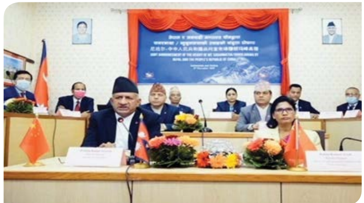
Joint Announcement of the New Height of Mount Sagarmatha/Zhumulangma by Nepal and China