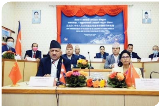
Joint Announcement of New Height of Mount Sagarmatha/Zhumulangma at a Ceremony Held Virtually on 8 December 2020

The two Presidents exchanged messages of congratulations on the historic occasion of joint announcement of 8848.86 meters as new height of Mt. Sagarmatha/Zhumulangma.