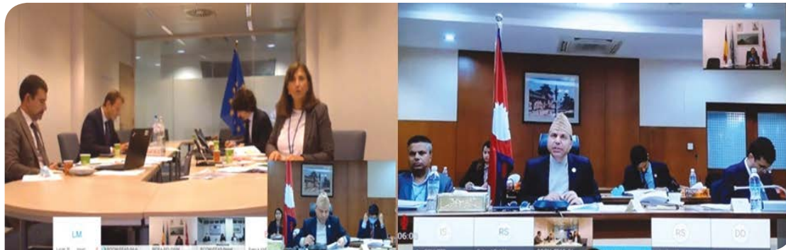
The Twelfth Meeting of Nepal-EU Joint Commission

Responding to Nepal's request for support during the COVID-19 crisis, the EU announced the mobilization of 2 million euros in humanitarian funding. Nepal requested for the activation of the EU Civil Protection Mechanism, which allowed for a coherent, collective response and helped pool the support from the EU member states. Fourteen countries including Germany, France, Spain, Ireland, Italy, Denmark, Finland, Belgium, Austria, Malta and Slovenia extended support to Nepal under this mechanism, which was facilitated by the EU Delegation in Kathmandu.