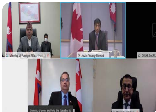
The Second Meeting of Nepal-Canada Bilateral Consultations Mechanism