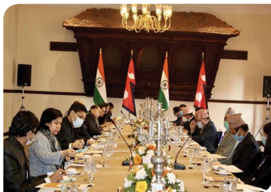
The Foreign Secretaries of Nepal and India at the Delegation-level Talks

The meeting reviewed various aspects of Nepal-India relations covering trade, transit, connectivity, infrastructure, energy, agriculture, investment, culture & people-to-people relations, among others. The meeting also discussed ways to strengthen the strong cultural and civilizational bonds that exist between the two countries and to further build on the solid foundation of the multifaceted friendly relations for the benefit of the two countries and peoples.