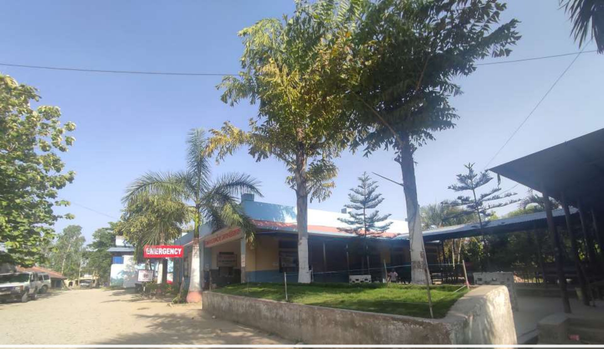
Provincial Hospital Kalaiya, Bara